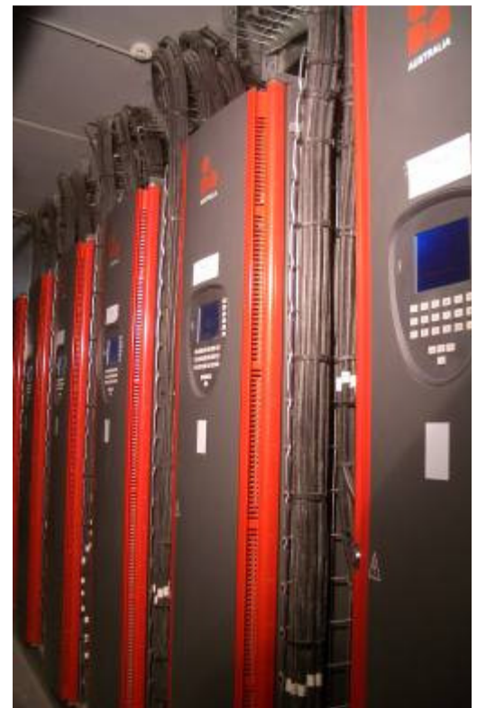
Dimmer Room View

The above lighting system can run on two control protocols: SANet or Artnet to allow users maximum flexibility.